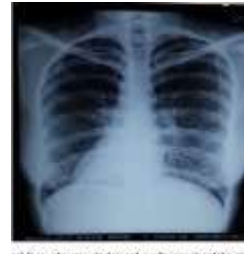
Fig. 1: X-ray of chest showing situs inversus totalis with situs inversus totalis